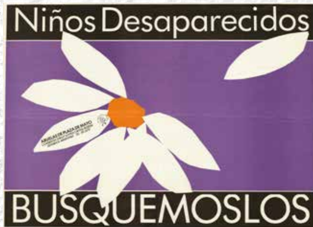
Middle: Unidentified artist, Niños desaparecidos: BUSQUEMOSLOS (Missing Children: Let's Find Them), Argentina, Abuelas de Plaza de Mayo, ca. 1982.