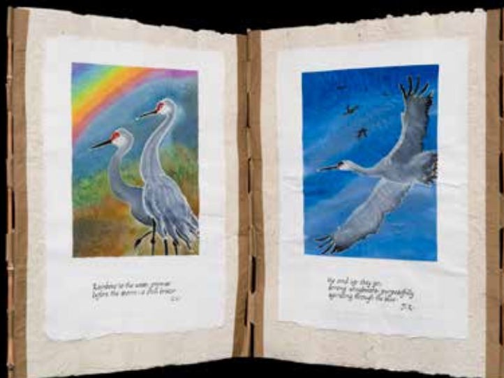
Pages from the Book of Cranes.