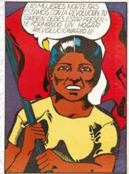
All other images on the page are from the Sam L. Slick Collection of Latin American & Iberian Posters (PICT 000-674 ) CSWR, University Libraries, University of New Mexico.