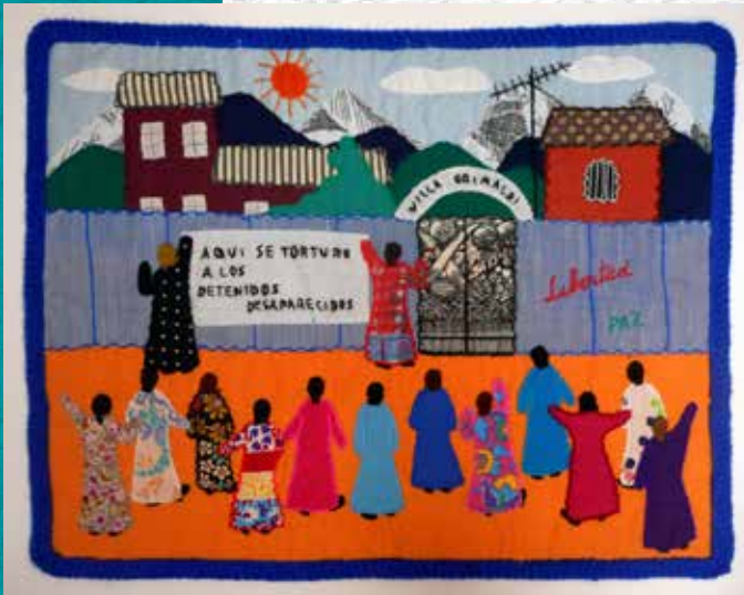
Top left: Unidentified artist, Villa Grimaldi: aquí se torture a los detenidos desaparecidos (Villa Grimaldi: The Detained and Disappeared Were Tortured Here), Chile, ca. 1983, cotton appliqué panel, 15 x 19 in., Chile Ephemera Collection.